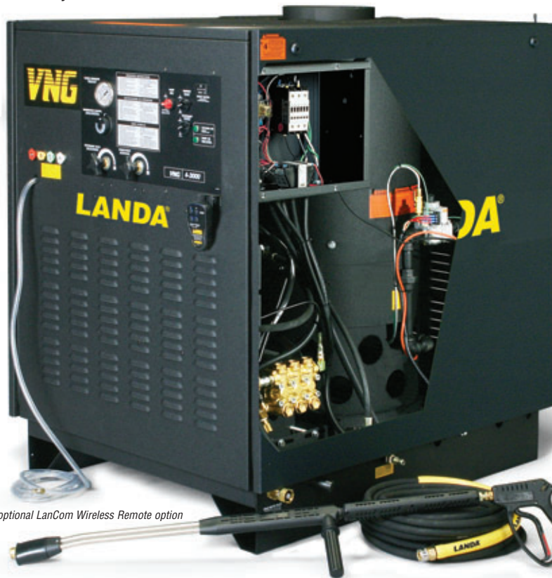
Shown with optional LanCom Wireless Remote option

■ Helpful Tri-Lingual Labels with operating instructions in English, Spanish and French for owner and operator protection.