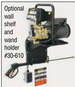
Optional wall shelf and wand holder #30-610

Landa's ZEF cold water pressure washer has a flexible design and industrial features that make it ideal for indoor use.